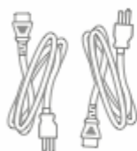
2 Power Cables

In addition to the MS switch, the following are provided (mounting kit provided with 1U models only):