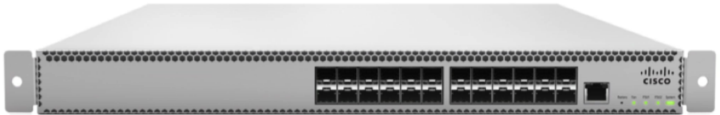
MS420-48 Series front panel