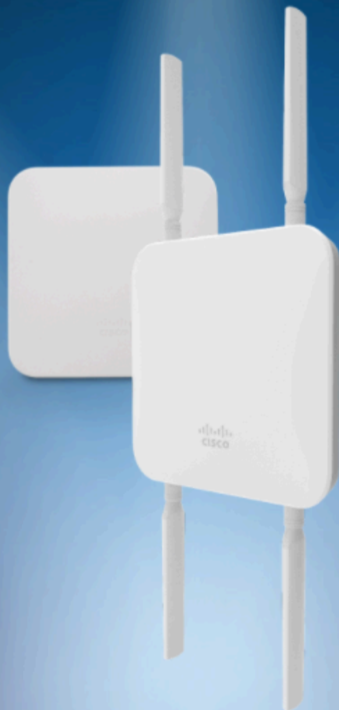
MG51 and MG51E cellular gateways